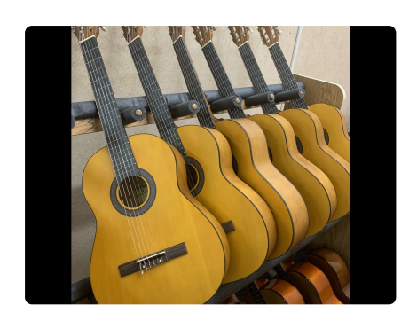
Arts Materials and Supplies